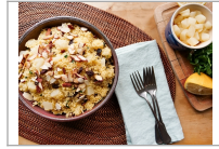
MONARCH PEAR, DICED NORTHWEST IN EXTRA LIGHT-SYRUP CANNED # 8791345