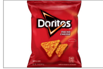
FRITO LAY CHIP, ASSORTED SS BAG # 4666838