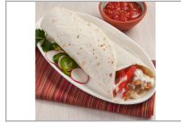
DEL PASADO TORTILLA, FLOUR 10" PRESSED SHELF STABLE # 3840340