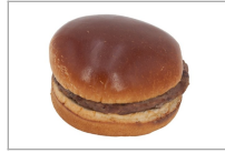
TURANO ROLL, BRIOCHE WHITE 4" ROUND SLICED BAKED FROZEN GLOSSY BUN # 7818156