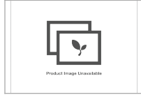
SWEET BABY RAY'S SAUCE, BBQ PLASTIC JUG SHELF STABLE ORIGINAL # 9844416