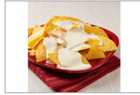
HARVEST VALUE TORTILLA, CHIP RAW 4 CUT YELLOW CORN 6" SHELF STABLE # 6334272