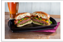
CHEF'S LINE BUN, HAMBURGER WHITE 4.5" SLICED BAKED FROZEN BULK # 9576471