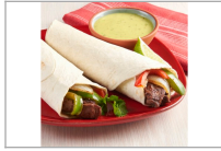
DEL PASADO TORTILLA, FLOUR 12" PRESSED SHELF STABLE # 3593294