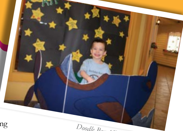
Doodle Bugs! Webster Center

Summer Camp 2011 is just around the corner and is sure to be the best summer adventure yet. Return your Summer Camp Contract by June 1 to receive the Early Bird Discount! 🍀