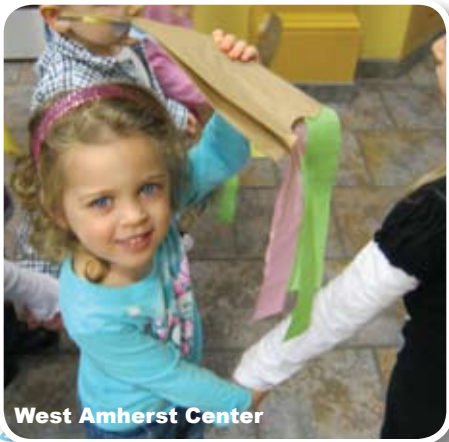
West Amherst Center