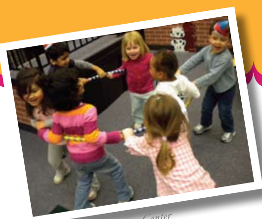
Doodle Bugs! Clarence Center