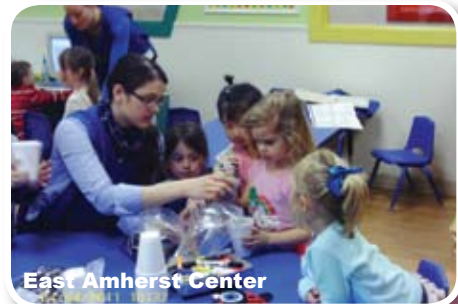
East Amherst Center