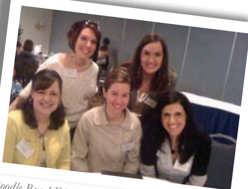
Doodle Bugs! Directors as Leaders