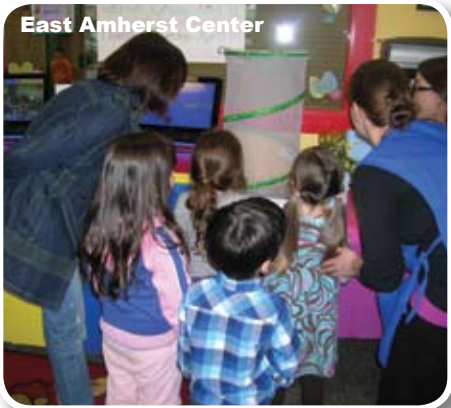
East Amherst Center