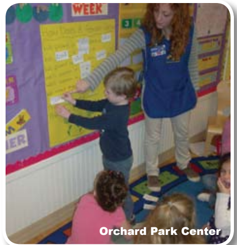
Orchard Park Center