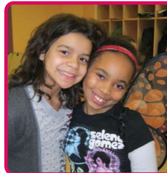
Doodle Bugs! West Amherst Center

Several doodle team members generously donated their time to volunteer at the 2011 Pride and Joy Families Weekend Conference in Rochester. The conference, held at the RIT Inn and Conference Center, focused on providing educational workshops related to research, advocacy, and support for gay, lesbian, bisexual and transgender families.