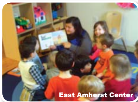
East Amherst Center