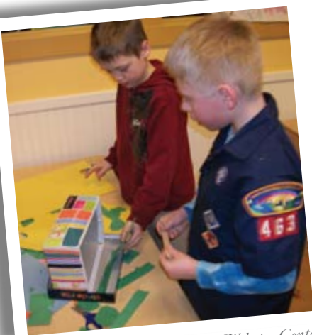
Doodle Bugs! Webster Center

The doodle community is growing. Doodle Bugs! is now offering franchise opportunities in NY, NJ, CT, MA, OH, PA, NC and FL. Please visit www.doodlebugsfranchise.com more information.