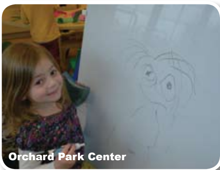
Orchard Park Center