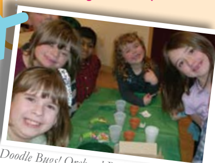
Doodle Bugs! Orchard Park Center