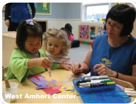
West Amherst Center